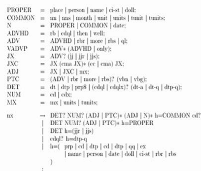
Figure 3 Noun block diagram

The above rule set constitute noun chunk nx.